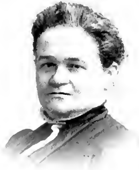
MARY VIRGINIA TERHUNE.

they have lived since 1884. Their family consists of one son and two daughters. Besides her church and charitable work, Mrs. Terhune has done a surprisingly large amount of literary work. She has contributed many tales, sketches and essays to magazines. She was for two years editor of the monthly "Babyhood," and conducted departments in "Wide Awake" and "St. Nicholas." In 1888 she established a magazine, "The Home-Maker," which she successfully edited. Her published books are: "Alone, a Tale of Southern Life and Manners" (1854); "The Hidden Path" (1856); "Moss Side" (1858); "Nemesis" (1860); "At Last" (1863); "Helen Gardner" (1864); "True As Steel" (1865); "Sunny Bank" (1867); "Husbands and Homes" (1868); "Phemie's Temptation" (1868); "The Empty Heart" (1869); "Ruby's Husband" (1870); "Jessamine" (1871); "Common Sense in the Household" (1872); "From My Youth Up" (1874); "Breakfast,